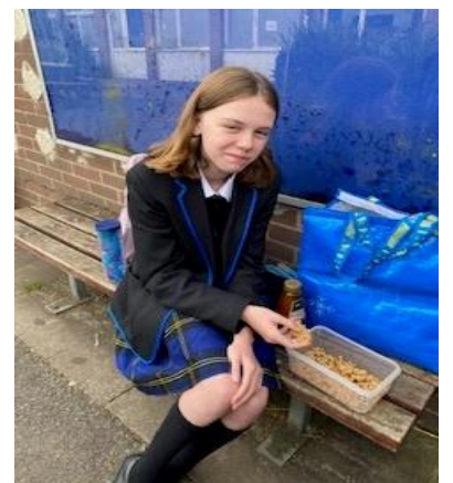
(Above) Enjoying flapjacks made in DT!

Well done to this Year 7 student (left) who really did 'think outside of the box' with his science homework! (He did have another shirt on underneath)